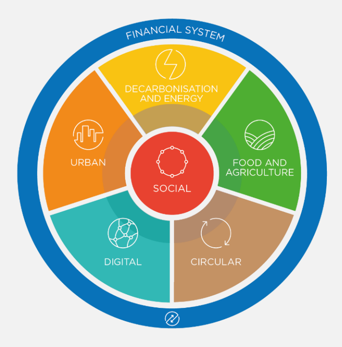
FIGURE 1: WBA'S SEVEN SYSTEMS TRANSFORMATIONS

WBA is benchmarking 2,000 companies across <u>seven systems transformations</u>. To put people at the heart of WBA's benchmarks, we will embed the 'leave no one behind' principle in the food, finance, urban, decarbonisation and energy, digital, and nature transformation benchmarks, by including a set of universal and transformation-specific social indicators in their respective methodologies.